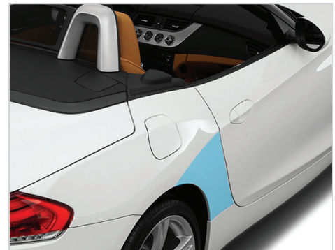
Rear Quarter Panels