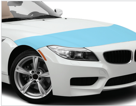
Partial Hood and Fender

Clear gloss polyurethane for stone chip protection, high wear, and abrasion in the automotive, motorcycle, RV, powersports, bicycle, aircraft, and other transportation markets.